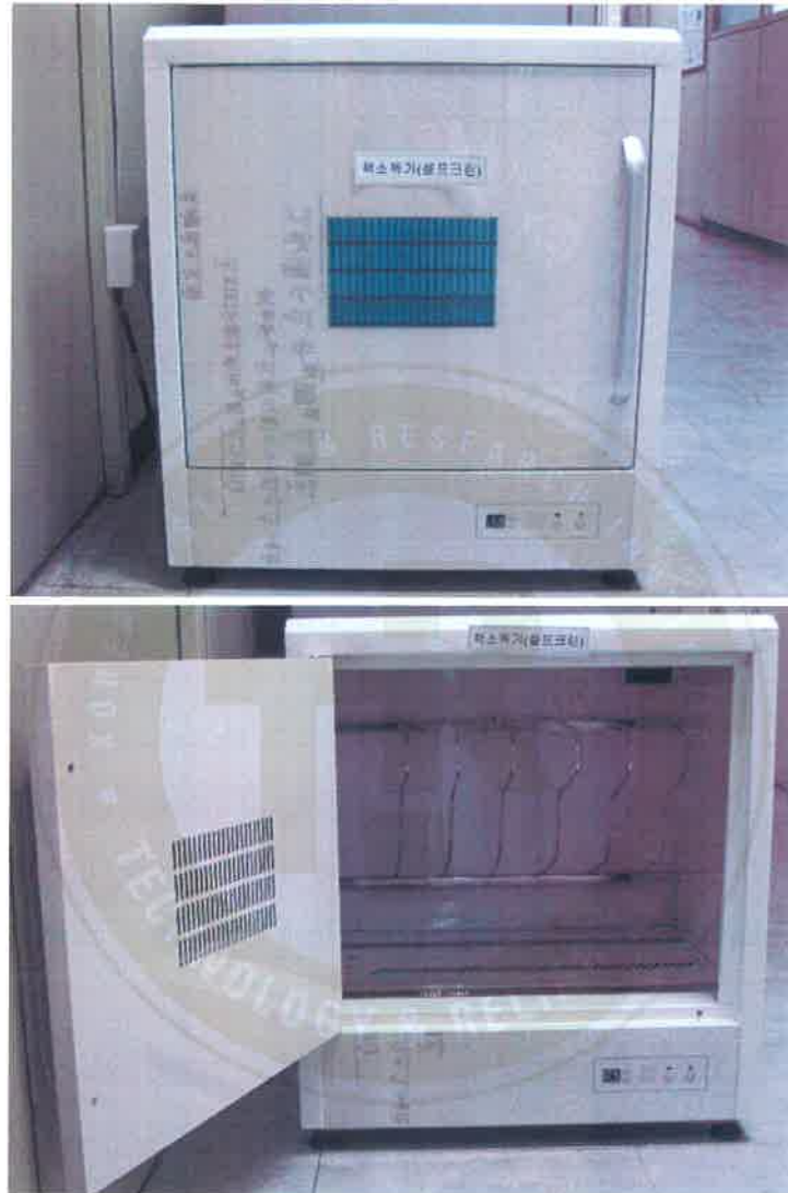
Book Sterilizer (Self Clean)