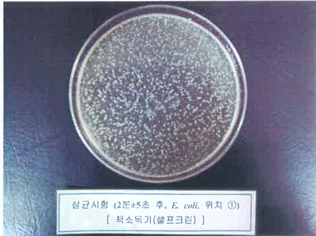
Bactericidal test (after 2 min ± 5 s, E. coli , test position ① ) [ Book Sterilizer (Self Clean) ]