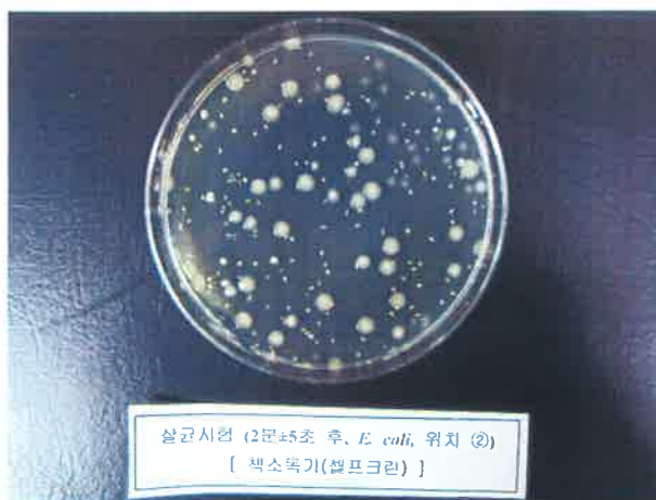
Bactericidal test (after 2 min ± 5 s, E. coli , test position ② ) [ Book Sterilizer (Self Clean) ]