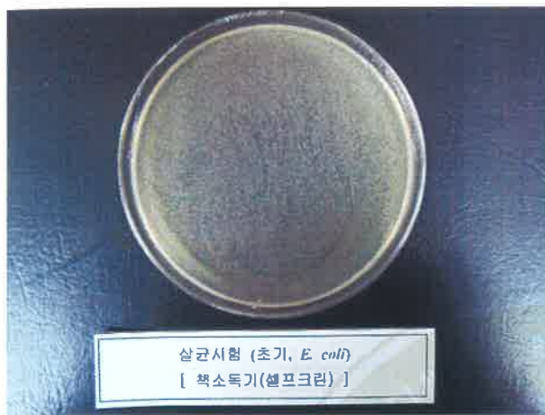
Bactericidal test (Initial, E. coli ) [ Book Sterilizer (Self Clean) ]