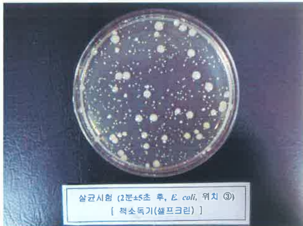
Bactericidal test (after 2 min ± 5 s, E. coli , test position ③ ) [ Book Sterilizer (Self Clean) ]